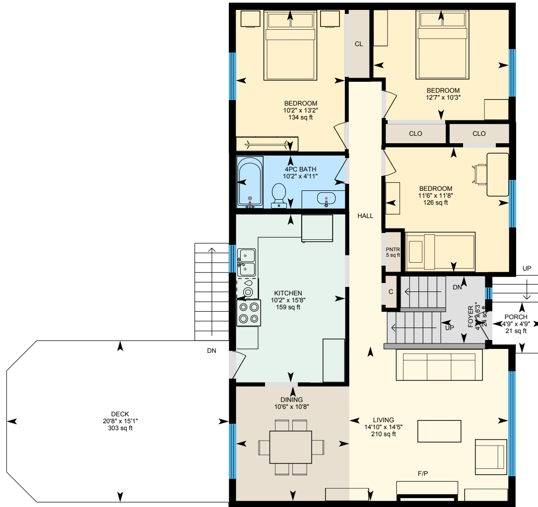
Main Floor - Ceiling Height 8' Finished Area 1243.90 sq ft

Main Building: Total Finished Area 2043.52 sq ft